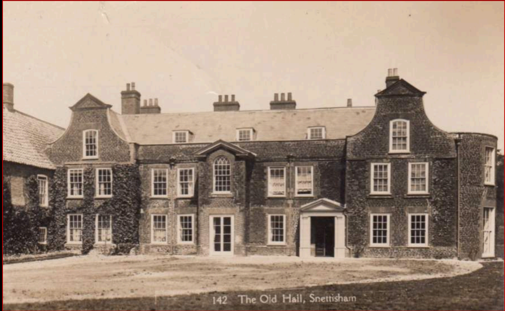
'What a treasure the scene now before me will be.' Gus's aunt Grace lived at Snettisham Old Hall