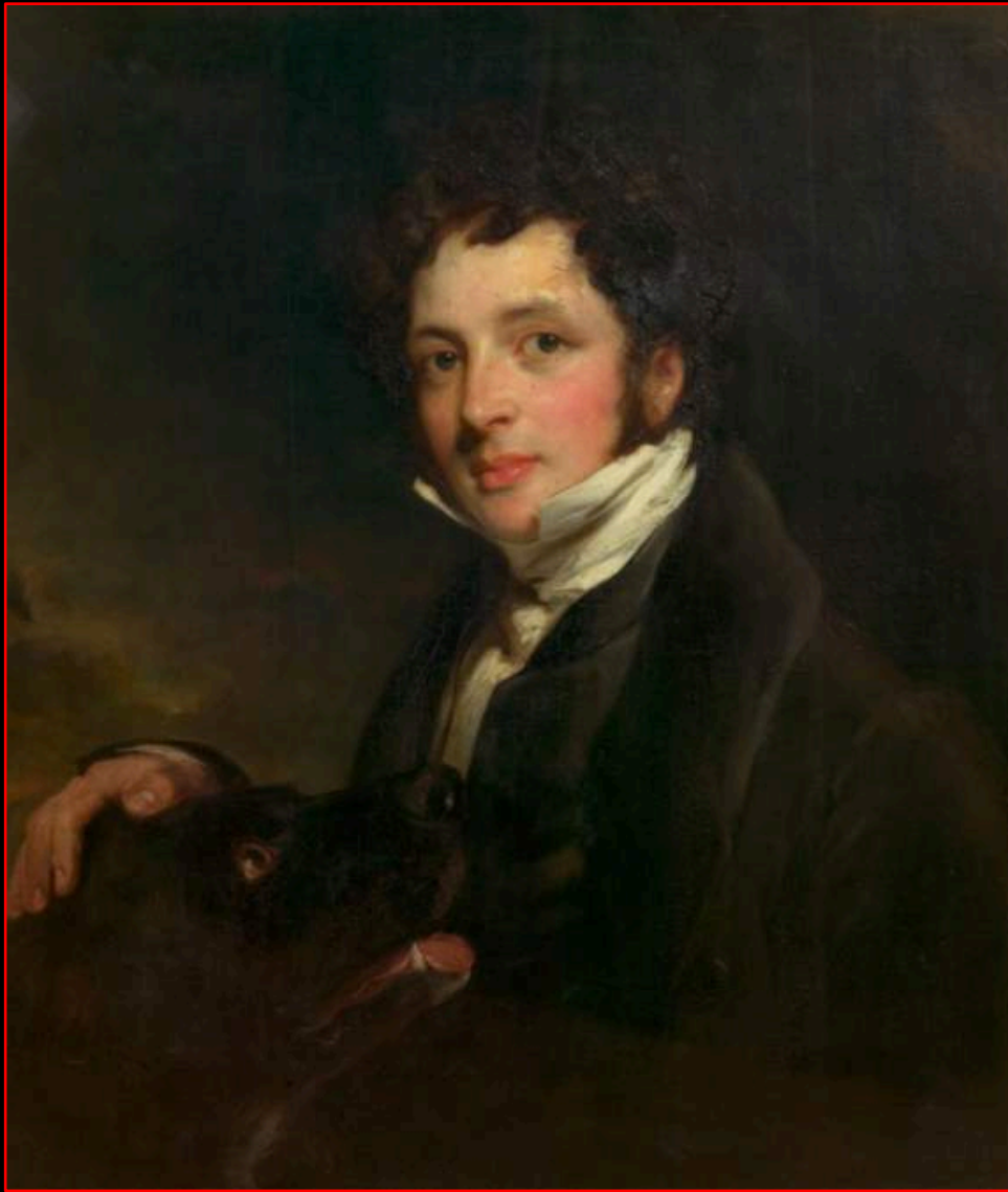
Chauncy Hare Townshend